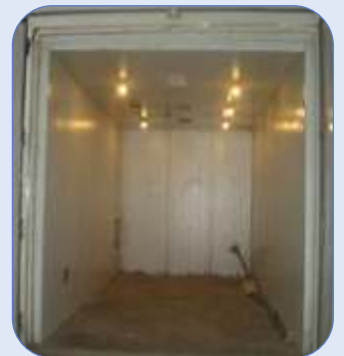
Walk- in Hot & Cold Chamber