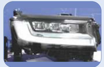
Lighting & Signalling Devices and many more...