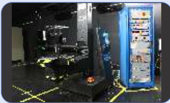
Type A Goni-meter (Automotive Goniometer)