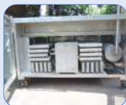
FDAS / FDSS