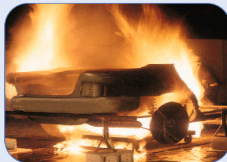
Fire Test for Batteries & Fuel Tanks