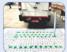
Reverse Park Assist Test and many more...