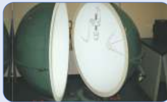
Integrating Sphere (1m & 2m)