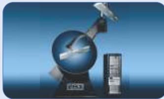
Type C Goni-meter