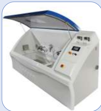
Cyclic Corrosion Facility