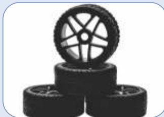
Tyres and Wheel rims