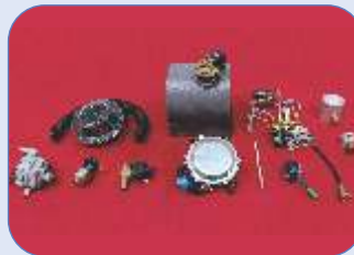
Alternate Fuel Components