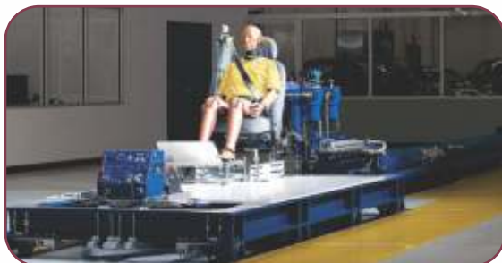
ADVANCED ACCELERATION SLED