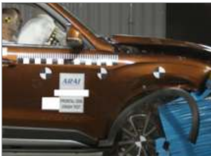
GNCAP Frontal ODB 64kph Crash: More than 80 tests