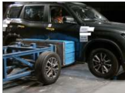
GNCAP Side MDB 50kph Crash: More than 50 tests