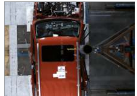
GNCAP Side Pole 29kph Crash: More than 15 tests