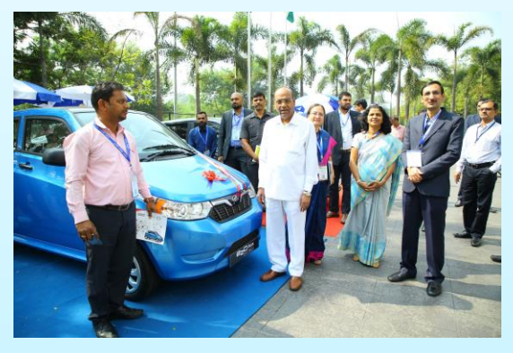
Visit of Dignitaries to Vehicle Display

Significance of ITEC India 2017 lies in the fact that three different organizations, representing three different domains viz.; IEEE from the electrical domain which dominates electric powertrain, SAE from the mobility engineering domain and ARAI from the automotive engineering, involving different domains, regulations, testing and validation and technology application area;, coming together to deliberate and discuss different aspects, challenges, opportunities and solutions for affordable and effective electrification of road vehicles in India taking into consideration different aspects of the complete eco-system involved.