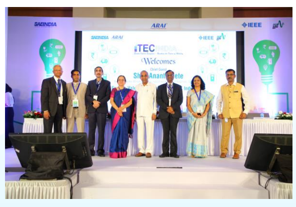
Dignitaries at the Valedictory Function

Shri Anant Geete, Hon'ble Minister, Ministry of Heavy Industries and Public Enterprises, Govt. of India, was the Chief Guest at the Valedictory Function. ARAI's E-Mobility Center of Excellence was also launched at the hands of Shri Anant Geete during the Valedictory Function.