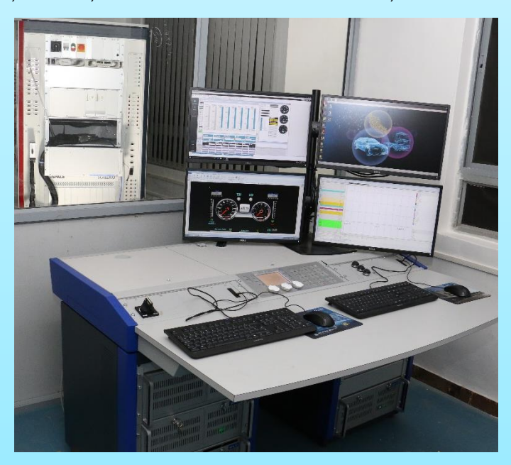
ARAI Virtual Calibration Facility

Virtual Test Bed facility at ARAI Virtual Calibration Centre (VCC) is aimed at significant reduction in development time and resource requirement for BS VI and beyond developments. In Virtual Test Bed based calibration, physical engine, after-treatment and vehicle are replaced by advanced real time models. Calibrations can be done for engine and vehicle level emissions. The system can be used for complete development, i.e. from concept investigation, emissions calibration, OBD calibration, vehicular performance to field trials, including ambient, altitude, Real Drive Emission evaluation, etc.